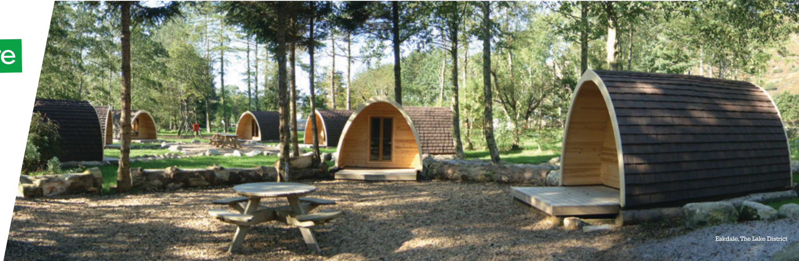
Eskdale, The Lake District