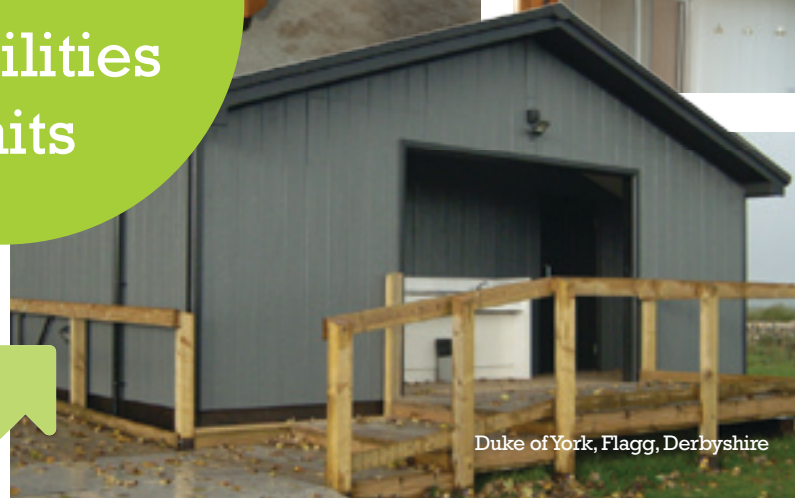
Duke of York, Flagg, Derbyshire