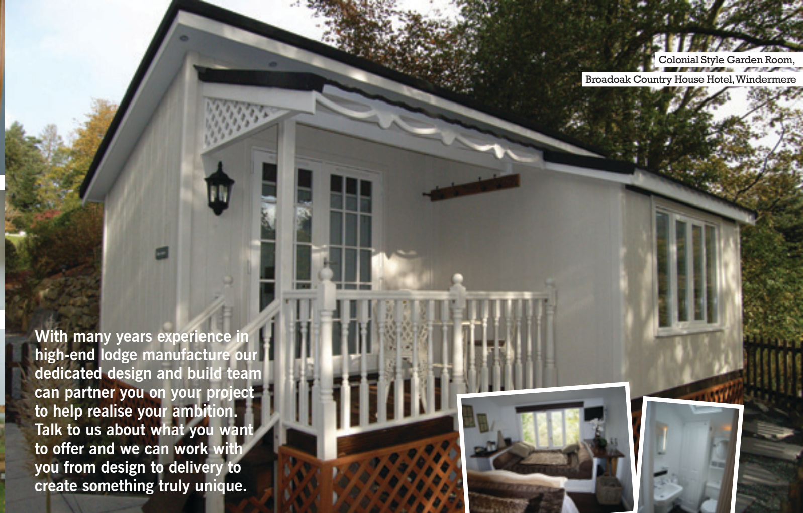
Colonial Style Garden Room, Broadoak Country House Hotel, Windermere

With many years experience in high-end lodge manufacture our dedicated design and build team can partner you on your project to help realise your ambition. Talk to us about what you want to offer and we can work with you from design to delivery to create something truly unique.