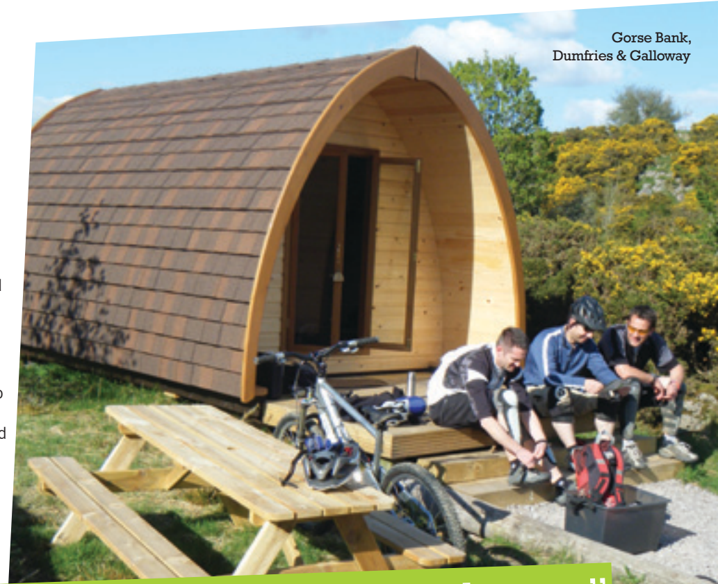
Gorse Bank, Dumfries & Galloway

We have developed a range of Pods to cover both the practical demands of the operator and the expectations of the customer. So, if you think the Pod will fit in to your world, please read on!