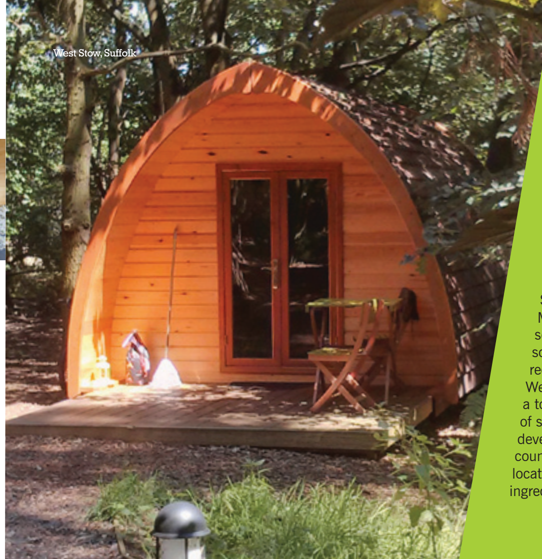
West Stow, Suffolk

West Stow Pods first opened their MegaPod-S doors to guests back in early 2013. Bookings were strong from the start which has justified adding two further units to the original pair as the interest and appreciation of the 'boutique' experience grows.